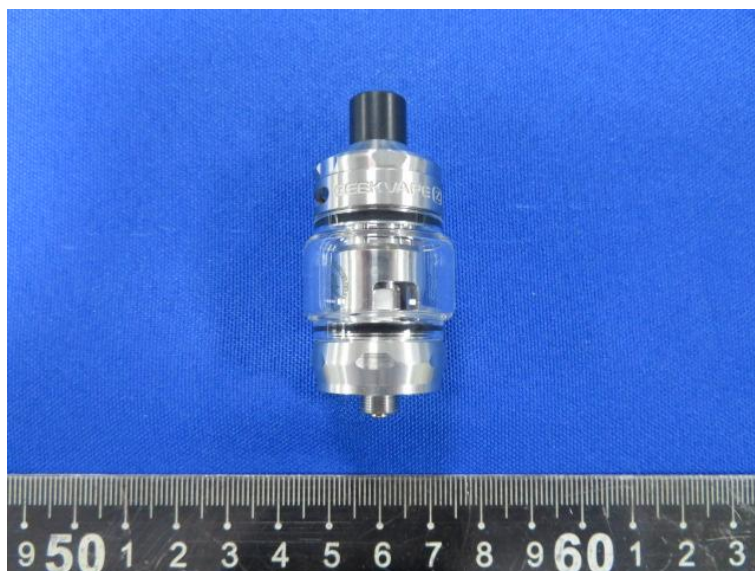
Geekvape Z Nano 2 Tank with 0.2ohm(50-28W), FeCrAl/0.6ohm(15-25W), FeCrAl